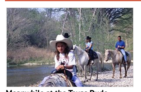
Meanwhile at the Texas Dude Ranch...