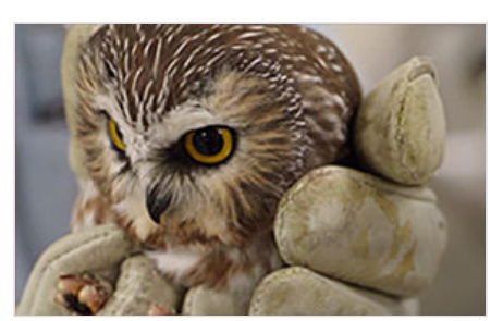
Crashing a wedding potentially saved this owl's life.