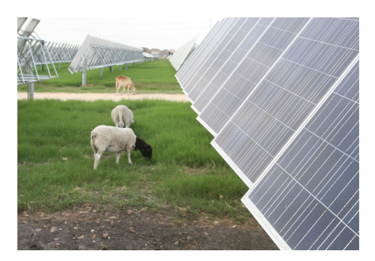
Alamo 2 Solar Farm

In 2011, the City of San Antonio identified its vision for a sustainable future through the SA 2020 process. This sustainability planning process is designed to create a roadmap to get to that vision. Throughout the planning process we will be asking for your help in determining sustainability goals and strategies, prioritizing strategies and developing steps to implement these strategies.