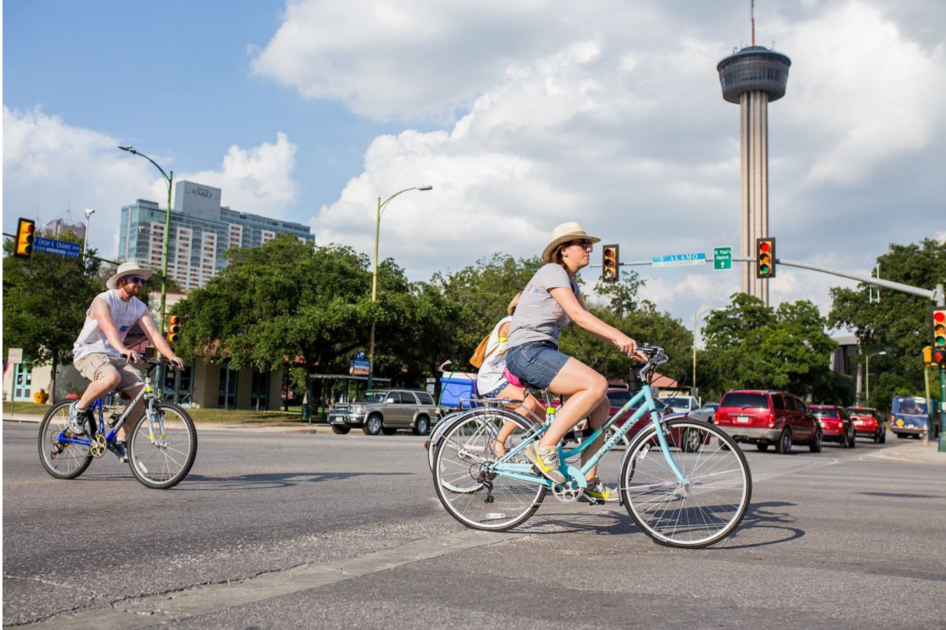
A group of cyclists cruise down South Alamo Street towards Southtown on the Fourth of July, 2014.

More recently, an online survey was conducted to help inform the MPO's Regional Bicycle/Pedestrian Transportation Plan (under development). While it provided helpful background information for that study, the survey was completed by less than 2,000 participants, so there are lots more people that can be heard from given additional opportunities like the SA Tomorrow Bike Survey.