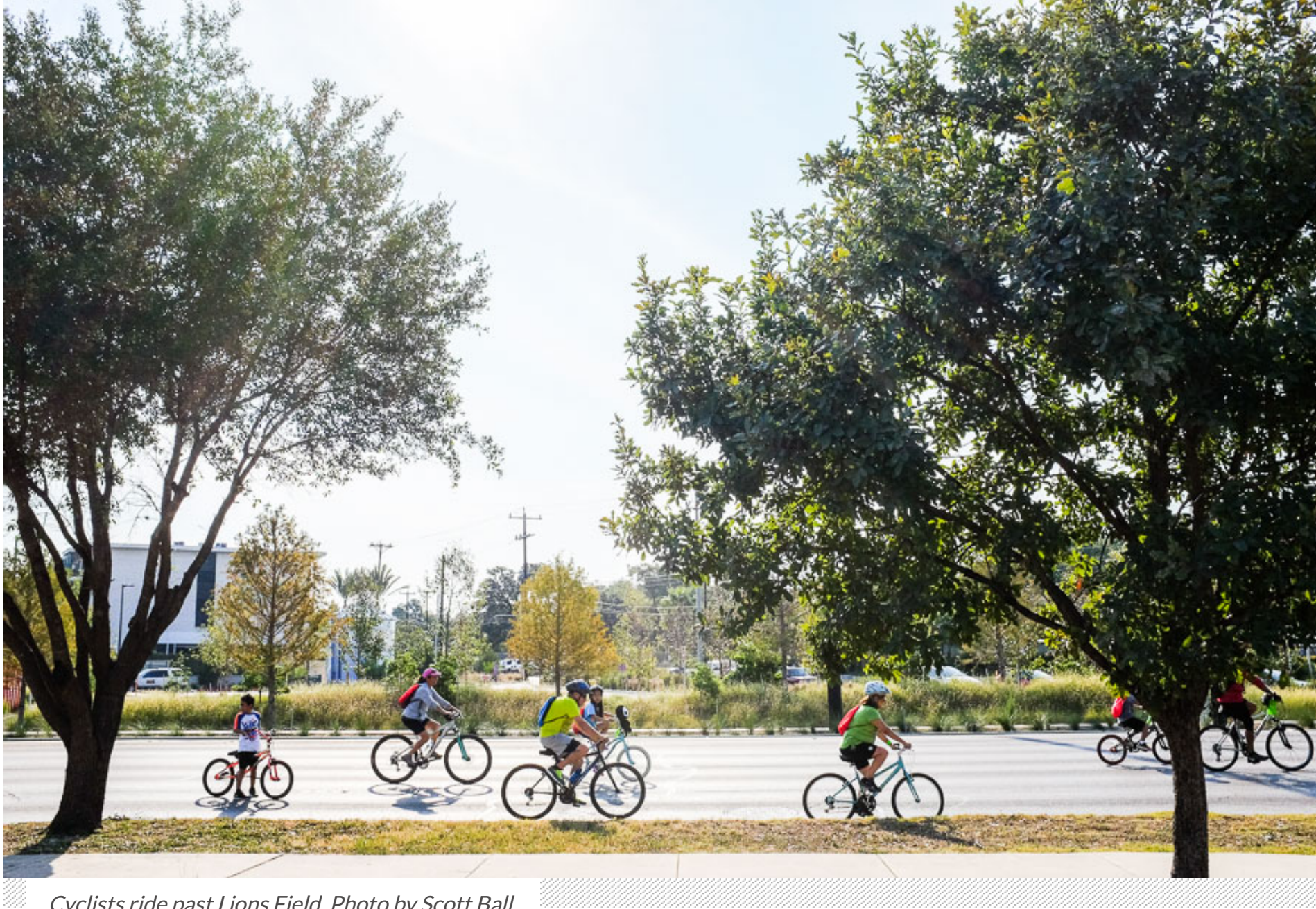
Cyclists ride past Lions Field.

Since the MPO works very closely with the City of San Antonio and with other cities in our study area on promoting safe driving, biking and walking habits, I'm especially looking forward to seeing the responses residents give to questions about the most important aspects of drivers' and bicyclists' behavior that I can be addressing as I talk to the public. I'm also looking forward to seeing what improvements residents say would most boost their riding and what specific challenges keep them from riding more.